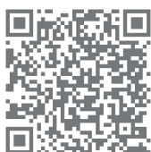
Stanford Accelerated Intelligent Neuromodulation Therapy for Treatment-Resistant Depression

*visor2 system is CE marked as a medical device in the EU, according to MDD 93/42/EEC, class IIA and has FDA clearance under 510(k) in the USA. Medical Device License (MDL) issued by Health Canada. TGA certified for medical use in Australia.